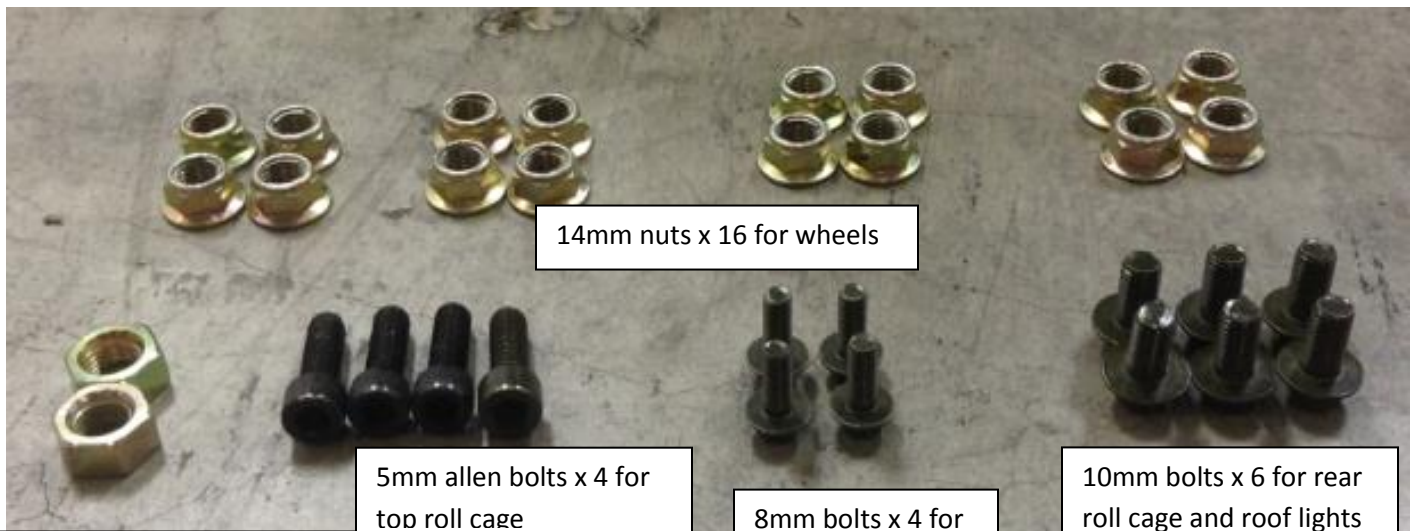
14mm nuts x 16 for wheels