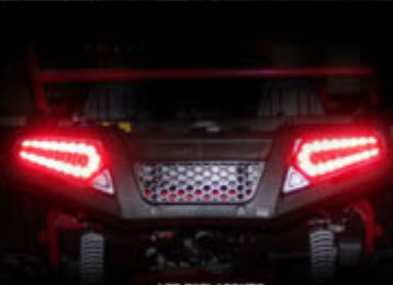
LED TAIL LIGHTS Beautiful LED Tail-lights Design