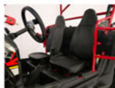
New Interior Design More Inner Space w/ adjustable seats