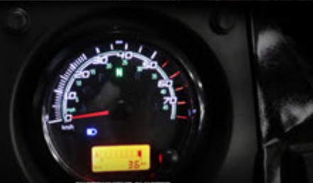
INSTRUMENT CLUSTER Stylish LCD Display