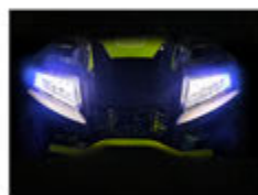
LED Headlights LED headlights & Turnsignal