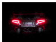
LED Tail Lights Brand New Style Tail Lights