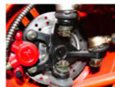
Front & Rear Disc Brake Hydraulic disc brake pump