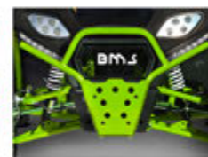
Front Bumper Custom Steel Bumper