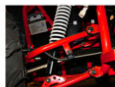
Front Independent Suspension with double A-arms