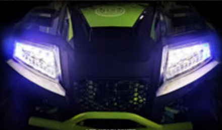
LED HEADLIGHTS Head lights, Dual Row LED Spot light