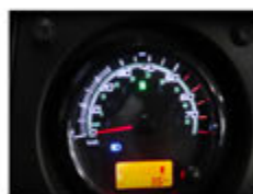
Instrument cluster Multi-function instrument panel