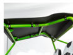
Powder Coated Rollcage with Hard Top Canopy